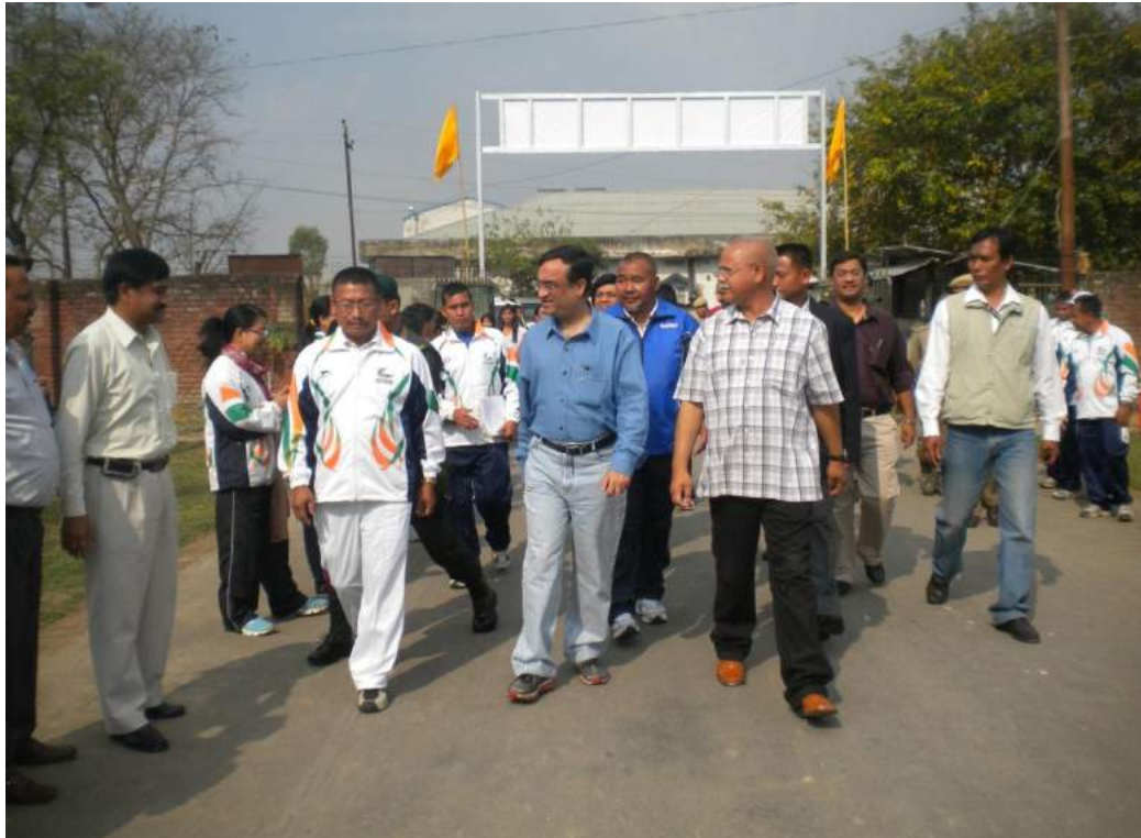
Hon'ble Union Minister of Sports Shri Ajay Maken pay a visit to SAI NERC Imphal Takyel – Manipur

Six Week Certificate Course Sports Coaching in the 3 (three) Sports Disciplines viz. 1. Boxing 2. Sepaktakraw & 3. Taekwondo was conducted at this Centre . Thirty-nine candidates from all over the India had attended this course . The course had been completed successfully. Guest Lecturer for Sports Sciences subject were engaged from Manipur University, DMO Bishnupur and the Coaches who had completed Master of Sports Coaching Science working under SAI, NERC, Imphal .