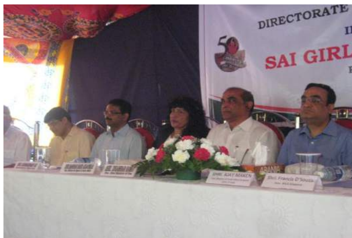
Inauguration of STC Peddem (Exclusively for Girls) on 28 th August 2011 by Sh.Ajay Maken, Hon'ble Minister for Youth affairs & sports, Govt. of India

SAI NS Western Centre Gandhinagar implements and monitors Sports Promotional Schemes of SAI in its region, the details are provided at Annexure -XXII :-